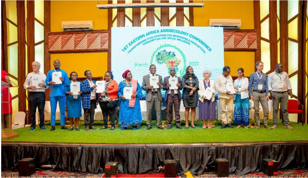
2023 Eastern Africa Agroecology Conference held in Nairobi