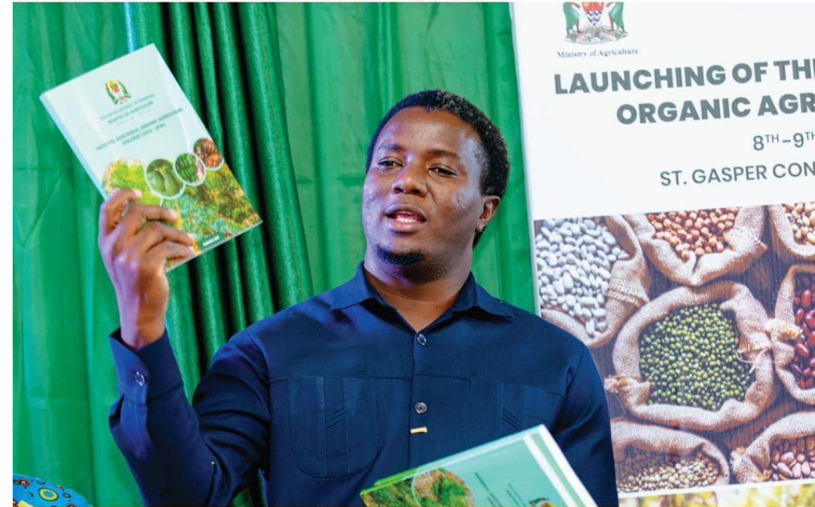
Hon. David Silinde, Deputy Minister of Agriculture launches The National Ecological Organic Agriculture Strategy (NEOAS) 2023-30