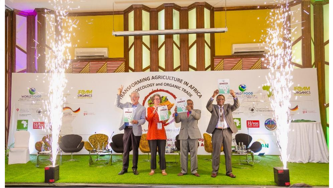
2019 International Conference on Agroecology held in Nairobi